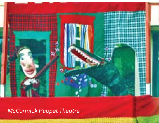
McCormick Puppet Theatre

Abundant in talent and musicality, come and listen to students from the Eden School of Music as they perform for you.