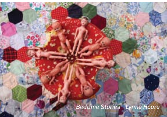
Bedtime Stories - Lynne Hoare