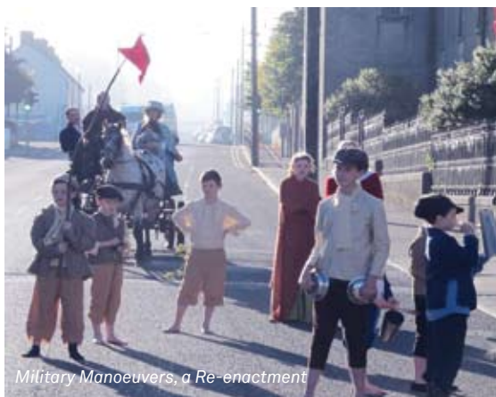
Military Manoeuvres, a Re-enactment