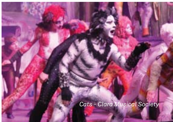
Cats - Clara Musical Society